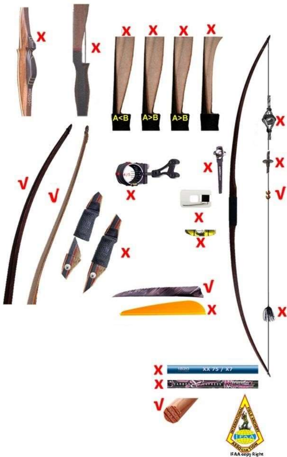
Pic. 2. TB according to IFAA