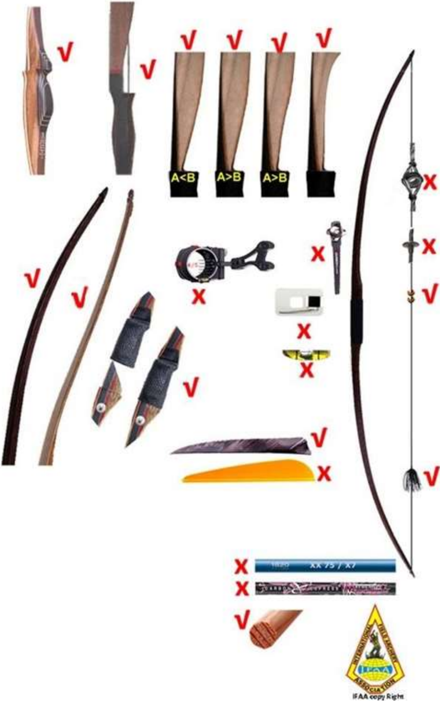
Pic. 3. LSB according to IFAA

LP - bows with an arrow shelf: one-piece and take-down, composite bows, with a window and/or shelf of any depth, with or without a pistol grip; wooden arrows with fletchings of natural materials (paper, feather, parchment, etc.), nocks of any material, bowstrings of any material. Bows may have straight and non-adjustable arrow rests in any form (plastic, metal, bristles, bristles, bristles, peel, etc.); wrappings woven into the chord are prohibited; only the saddle or bowel on the chord and chord silencers placed at least 305 mm above and below the nock point.